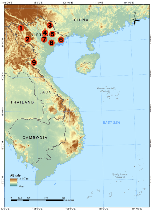
Figure 1. Map of Indochina, with Vietnamese provinces where Sinomicrurus kelloggi occurs indicated by numbered red circles. Localities include Lai Chau (1), Son La (2), Cao Bang (3), Bac Kan and Thai Nguyen (4), Lang Son (5), Quang Ninh (6), Vinh Phuc (7), Hai Duong (8), and Nghe An (9). The new record is the southernmost locality for the species in Vietnam.

of the frontal, from where the lines widen to about two dorsal scales wide and continue dorsolaterally towards the neck. The dorsal surface from the neck to the tail is reddish-brown with 24 black, thin (slightly less than one scale or same size as one scale) transverse bands, each extending laterally to the ventrals (not on the ventrals), which is edged faintly with white bands, as well as, with small paired black spots about 1/8 the size of a scale at dorsolateral around mid-body, and small black spots about equal to, or smaller than 1/10 of a scale along the vertebral scale (Fig. 3C). The ventral surface is yellowish white with 45 black bands or blotches. Based on the morphology and colouration, the specimen (IEBR R.6336) was identified as S. kelloggi (Table 1). Among the three species of Sinomicrurus found in Vietnam, S. kelloggi differs from both S. peinani and S. maclellandi by having 15 midbody scale rows (13 in S. peinani and S. maclellandi ; Smart et al., 2021) and by having a white chevron mark on the head (broad white band in S.