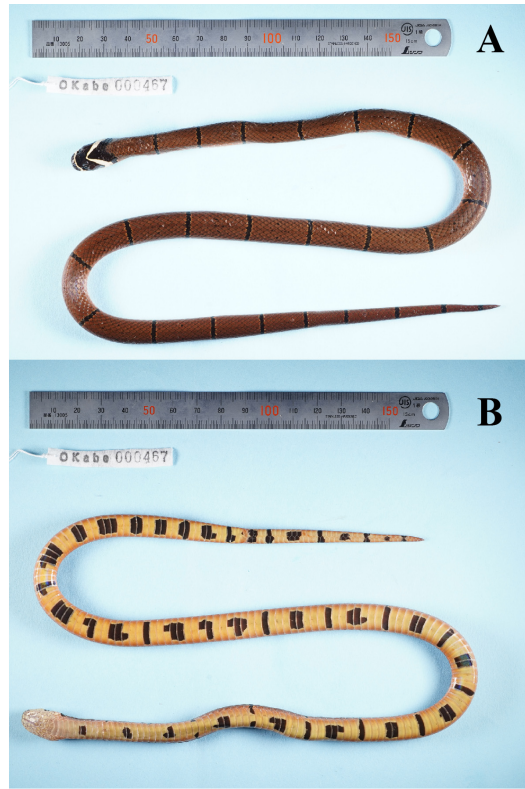
Figure 2. New individual of Sinomicrurus kelloggi from Nghe An Province, Vietnam (IEBR R.6336 [Field Number: OKabe 467]). Photos showing (A) dorsal and (B) ventral body.

Sinomicrurus kelloggi specimen IEBR R.6336 represents the first record of this species from Nghe An Province (Pope, 1928, Fan, 1931, Bourret, 1936, Peng et al., 2018, Smart et al., 2021), indicating that the range of S. kelloggi extends to Truong Son Range in central Vietnam. The new locality is approximately 224 km south of Hai Duong Province and represents